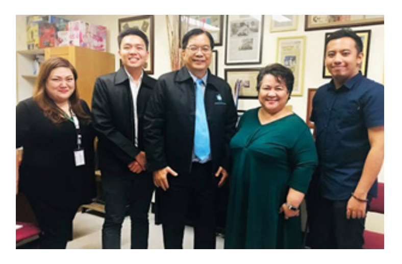
Follow-Up Meeting and Courtesy Visits to ASEAN Autism Mapping Project Partners and Stakeholders, 29 January –1 February 2019, Quezon City, Philippines