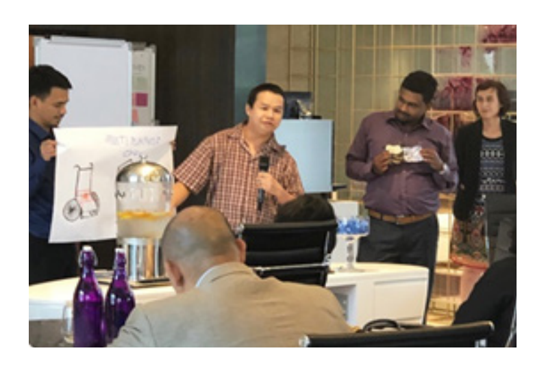
APCD Joined Singapore Cooperation Programme's 'Course on Empowering Persons with Disabilities and Special Needs', 27-31 May 2019, Singapore