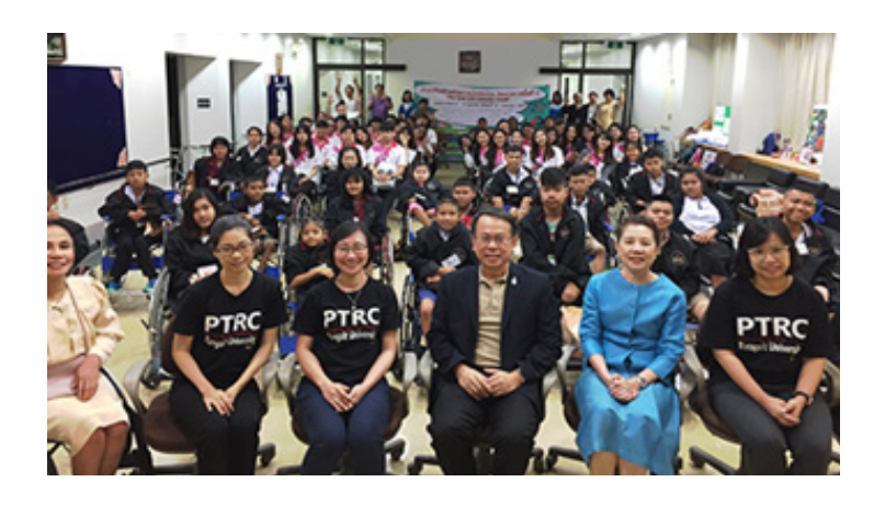
Study visit of WAFCAT and Students from Rangsit University at APCD, 9 October 2019, Bangkok, Thailand