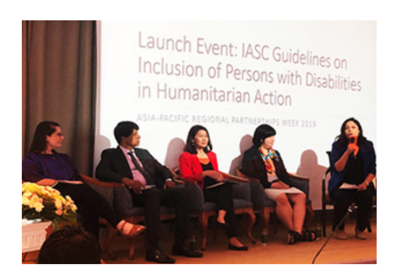
APCD joined Launch Event on 'Inter-Agency Standing Committee (IASC) Guidelines on Inclusion of Persons with Disabilities in Humanitarian Action', 28 November 2019, Bangkok, Thailand