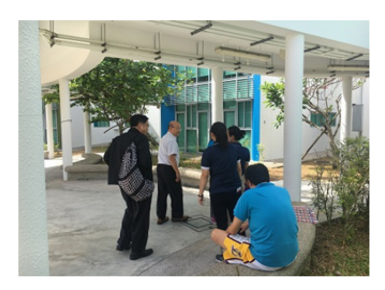
Visit and Meeting with Partners for the ASEAN Autism Mapping Project, 11-15 February 2019, Singapore