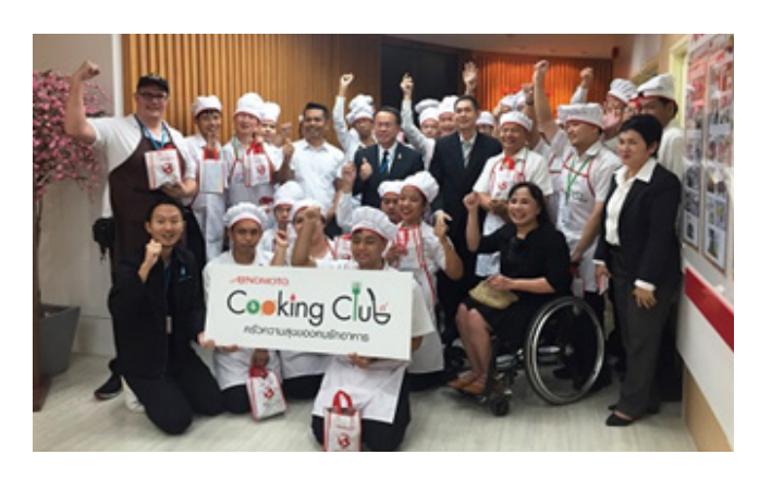
APCD's 60+ Plus staffs and trainees undergo cooking class at Ajinomoto Cooking Club, Bangkok, Thailand, 5 June 2019

Staffs and trainees with disabilities from APCD's 60+ Plus Projects for All Series team had some fun activities learning to cook at the Ajinomoto Cooking Club in Bangkok, Thailand on 5 June 2019.