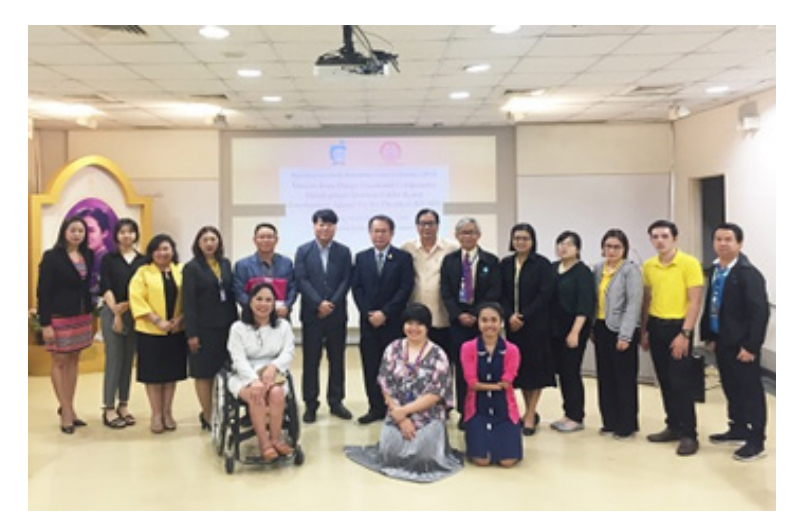
Study Visit of Daegu Vocational Competency Development Institute from South Korea, 31 July 2019, in Bangkok, Thailand