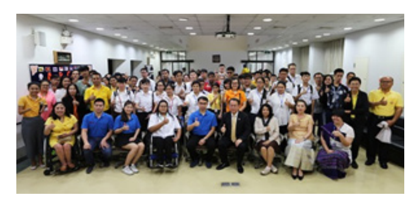
60+ Plus Projects for All Skills Development Training for Persons with Disabilities: Employability in Food Business 2019, Bangkok, Thailand, 18 July 2019