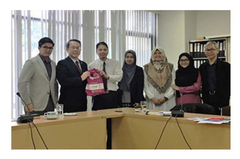
Study Visit of Researchers from the International Islamic University of Malaysia on Employability for Persons with Disabilities to APCD, 10 October 2019, Bangkok, Thailand