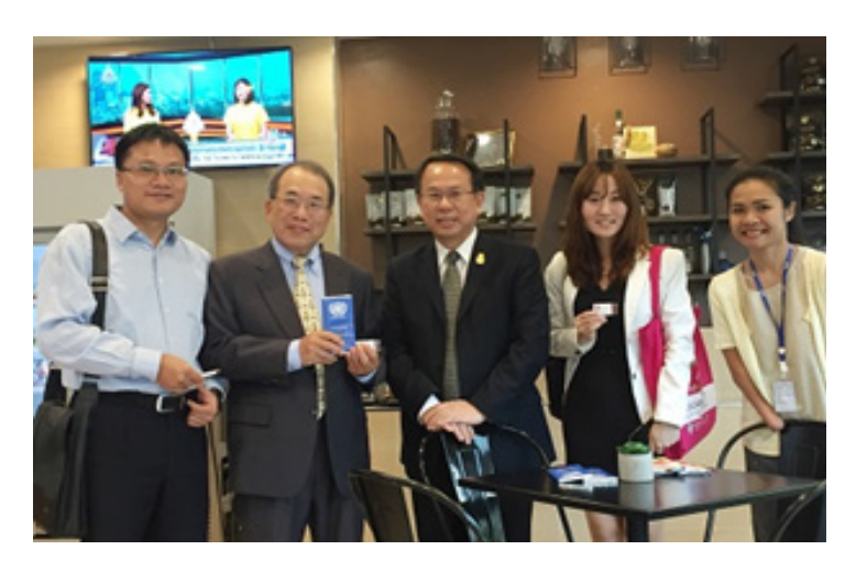
Visit from officials of Taipei Economic & Cultural Office (TECO) on 5 July 2019 in Bangkok, Thailand