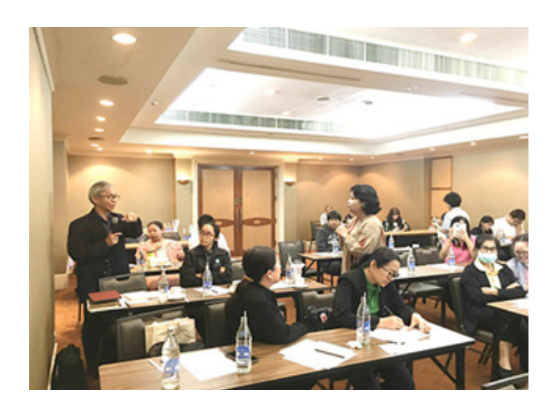
APCD attended a Workshop on "Promoting the Sexual and Reproductive Rights, and Rights Knowledge to Youths with Disabilities", 25 December 2019, Bangkok, Thailand