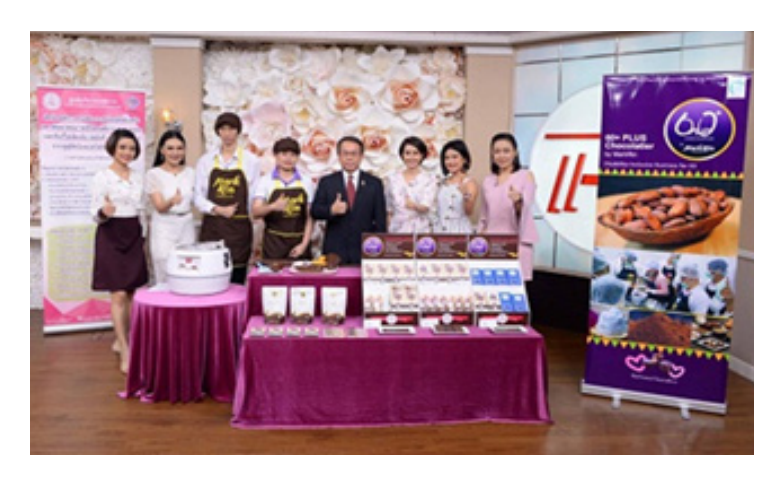
APCD's 60+ Plus Chocolate Products and Café Featured on Thai TV Channel 3, 13 February 2019 Bangkok, Thailand