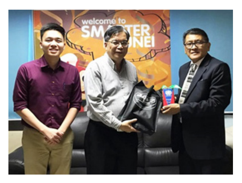
Follow-Up Meetings with ASEAN Autism Mapping Project Partners and Stakeholders, 14-16 January 2019, Bandar Seri Begawan, Brunei