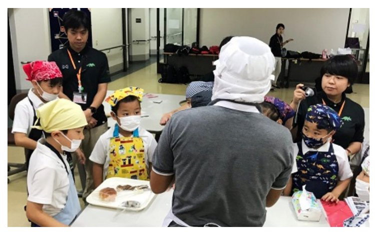
Thai-Japan Association School Study visit and Workshop on Bakery at APCD, 12 February 2019 Bangkok, Thailand