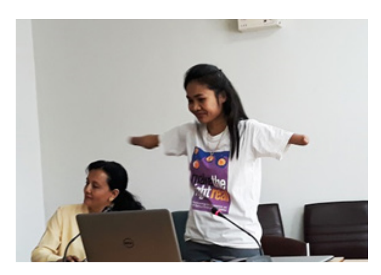
APCD Internal Capacity Development Training on International Instruments (UNCRPD, SDGs, Incheon Strategy, and ASEAN Enabling Master plan) 25 January 2019, Bangkok, Thailand