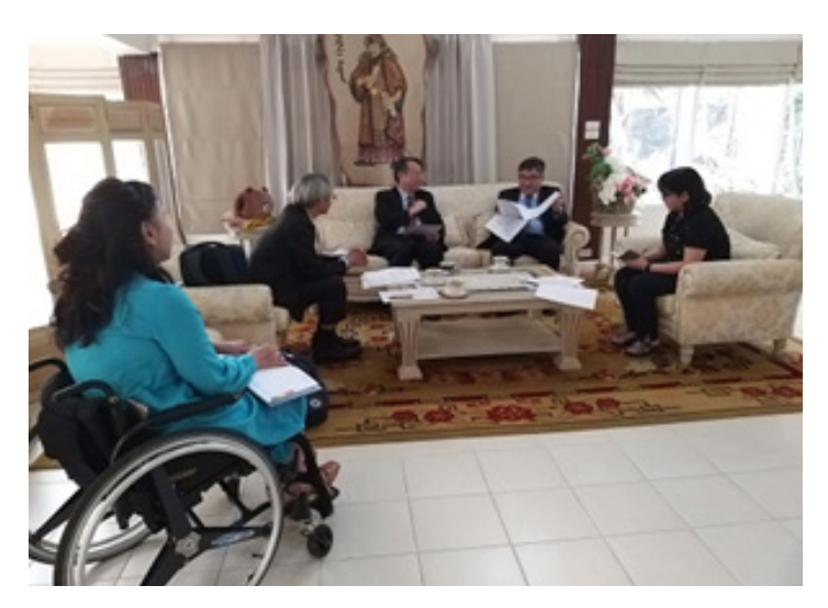
Courtesy Call of APCD to the Ambassador of Mongolia, 30 January 2019, Bangkok, Thailand