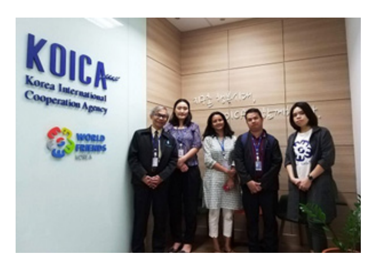
Exploratory Meeting for Future Collaboration with Korea International Cooperation Agency (KOICA), 28 January 2019, Bangkok, Thailand