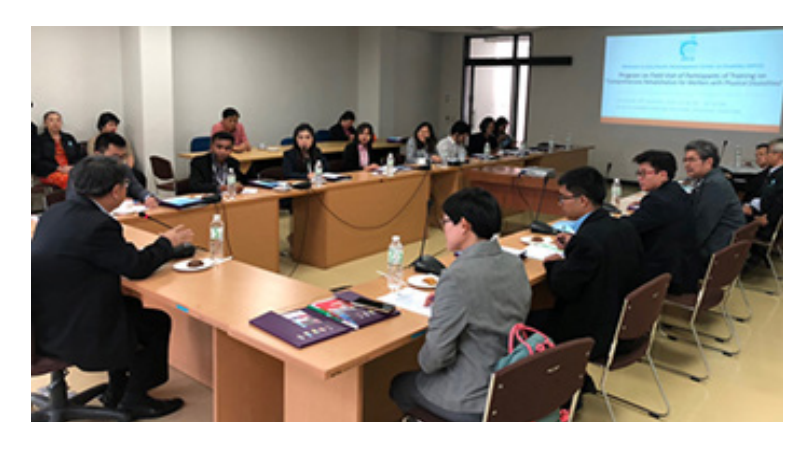
ASEAN Delegates from Training on "Comprehensive Rehabilitation for Workers with Physical Disabilities" at APCD, 29 August 2019, Bangkok, Thailand